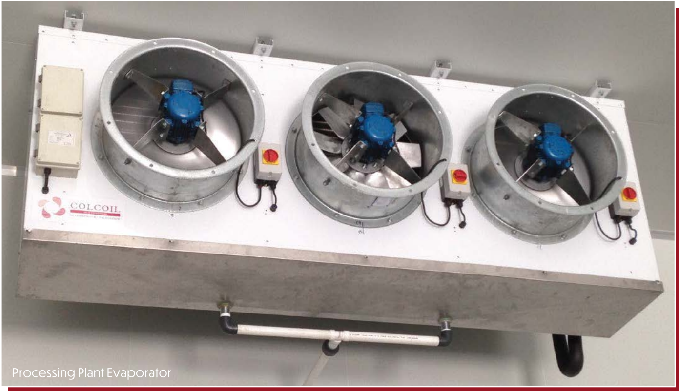
Processing Plant Evaporator

ColCoil manufactures coils and assembled products to customer specifications. We use Unilab software for accurate coil designs to confidently deliver the required performance required from each customer.