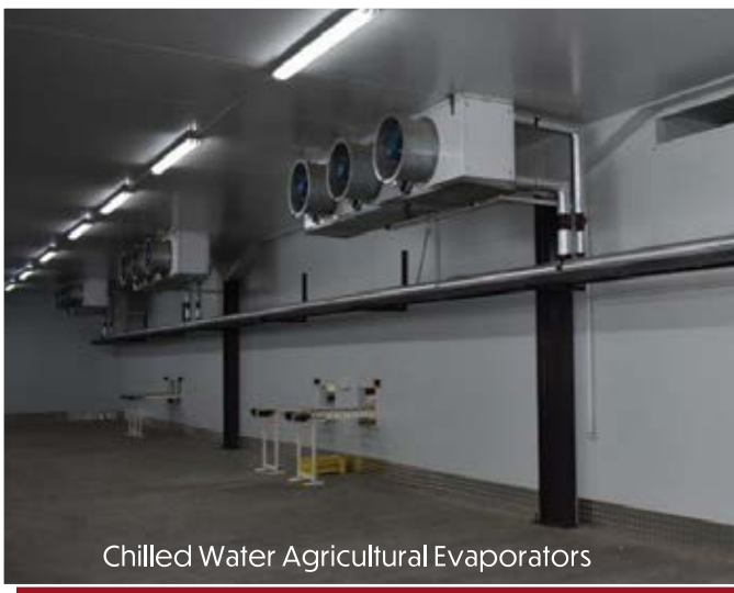
Chilled Water Agricultural Evaporators

ColCoil offers casings in stainless steel, galvanised steel as well as powder coated galvanised steel available through Colcab's state of the art sheet metal shop equipped with the latest technology in laser cutting, CNC punching and bending.